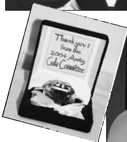
Awty friends and guests were the finest gems at this year's gala for raising more than $160,000!