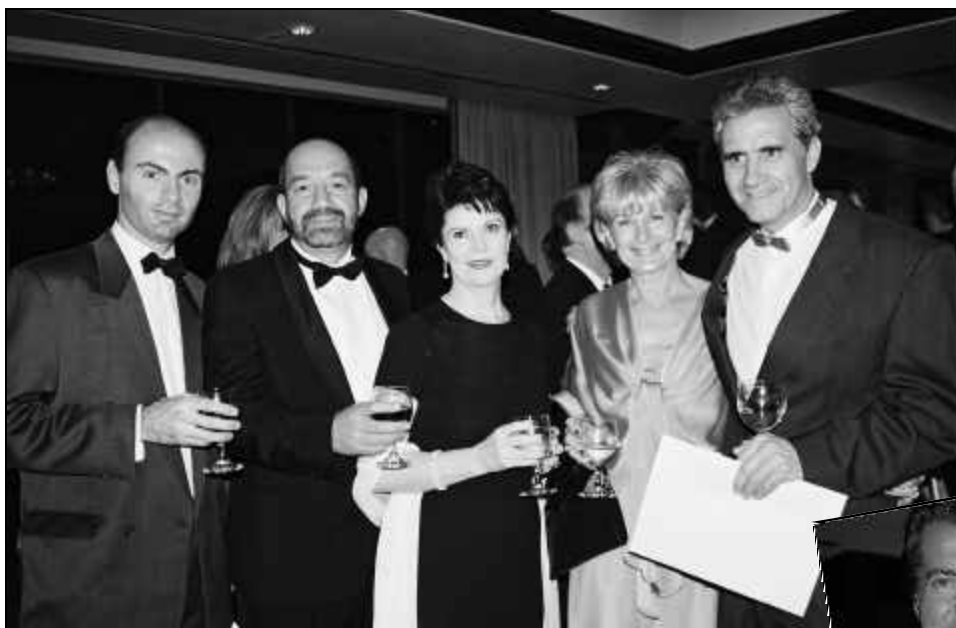
The grand ballroom at the Houstonian Hotel was the site for the Diamond Gala 2004. It was a flawless affair!